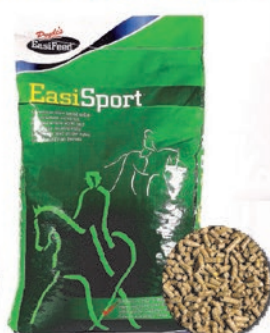
• EasiSport fibre base pellet