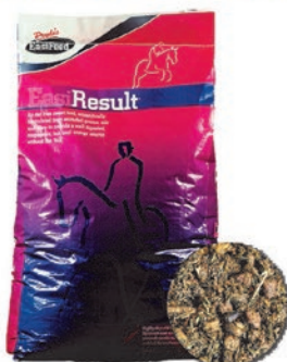
• EasiResult cooked muesli feed